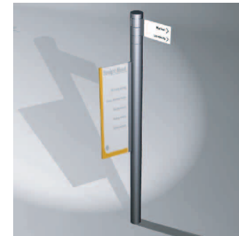
Optional light weight promotional panels