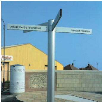
150mm diameter aluminium post