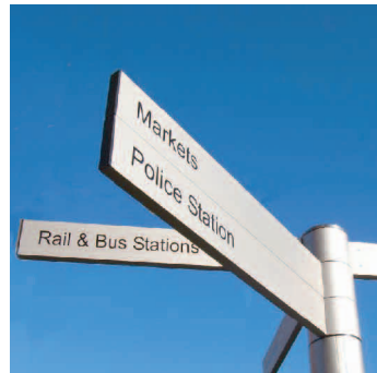
Anodised or painted aluminium fingers