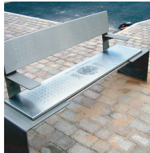
Shot peened leg supports and brushed seat pan