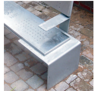
Solid end also doubles as skateboard deterrent