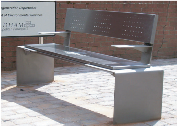
Stainless steel seat with custom etching and perforations