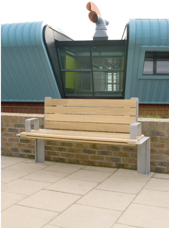
1.5m seat with shot peened stainless steel frame