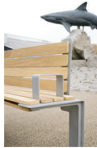
Fully welded armrest