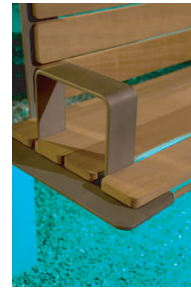
Underside LED illumination