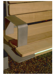
Front edge illumination